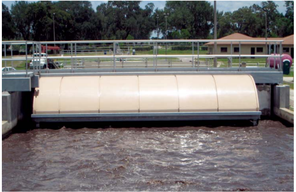
Lakeside's rotor as seen from the bridge of an operating rotor upstream in the channel.

The operational concept of the BNR system was to continuously monitor DO levels and adjust the rotor speed to maintain a preset DO concentration. This concept included flex-